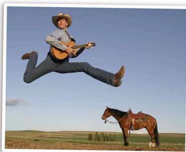
Special Guest Star: Wylie & the Wild West